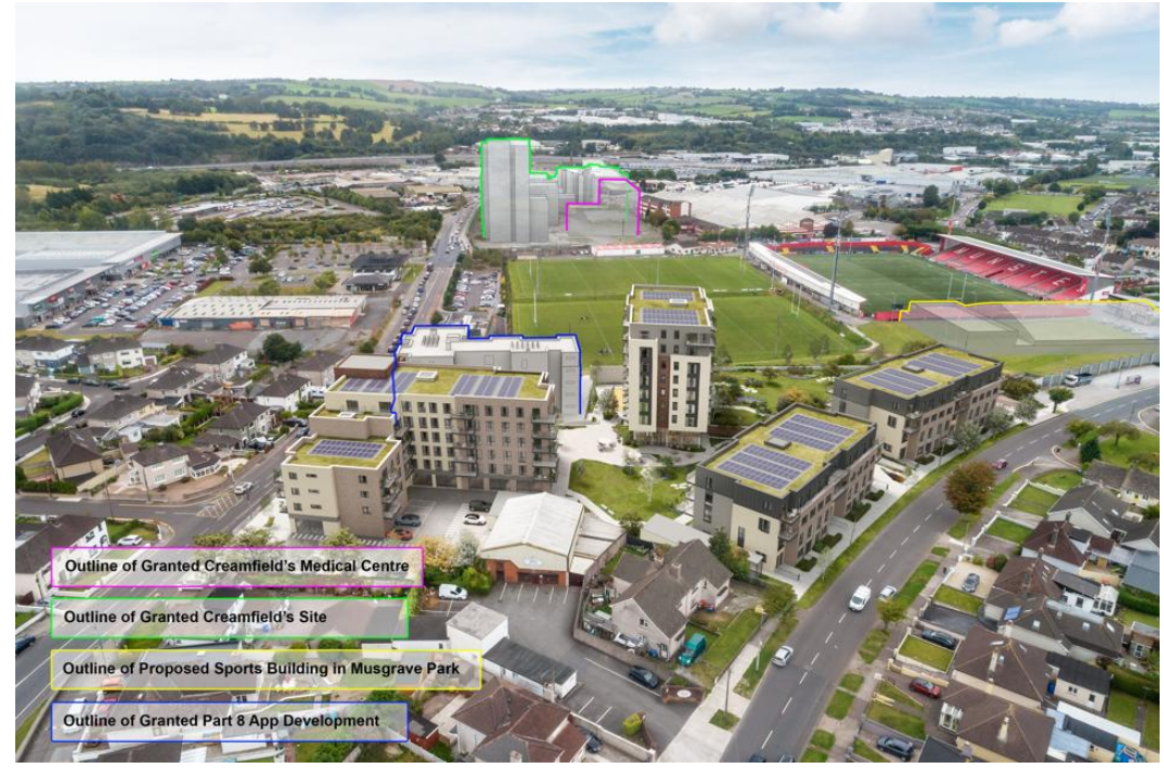
Plate 2: Proposed Development in the context of the permitted developments in the immediate vicinity