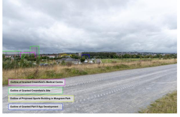
Plate 9: View from Tramore Valley Park to the north-west (cumulative)