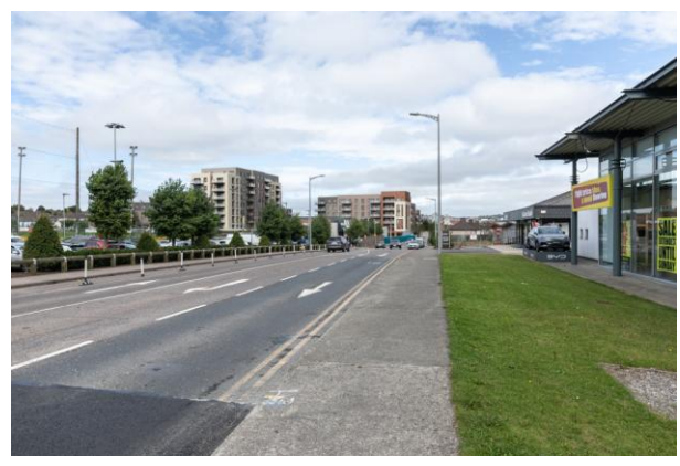
Plate 5: View from Kinsale Road to the south-west (cumulative)