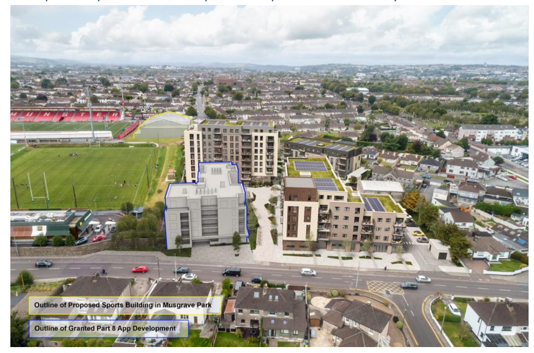
Plate 3: Proposed Development in the context of the permitted developments in the immediate vicinity