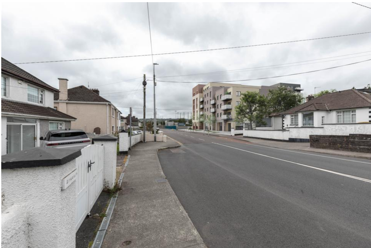
Plate 3: View from Kinsale Road to the site to the south-west (with scheme)