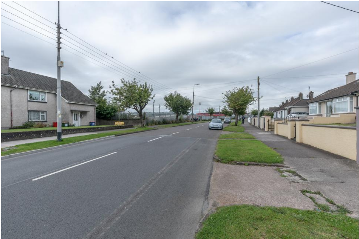
Plate 8: View from Pearse Road to the south-west