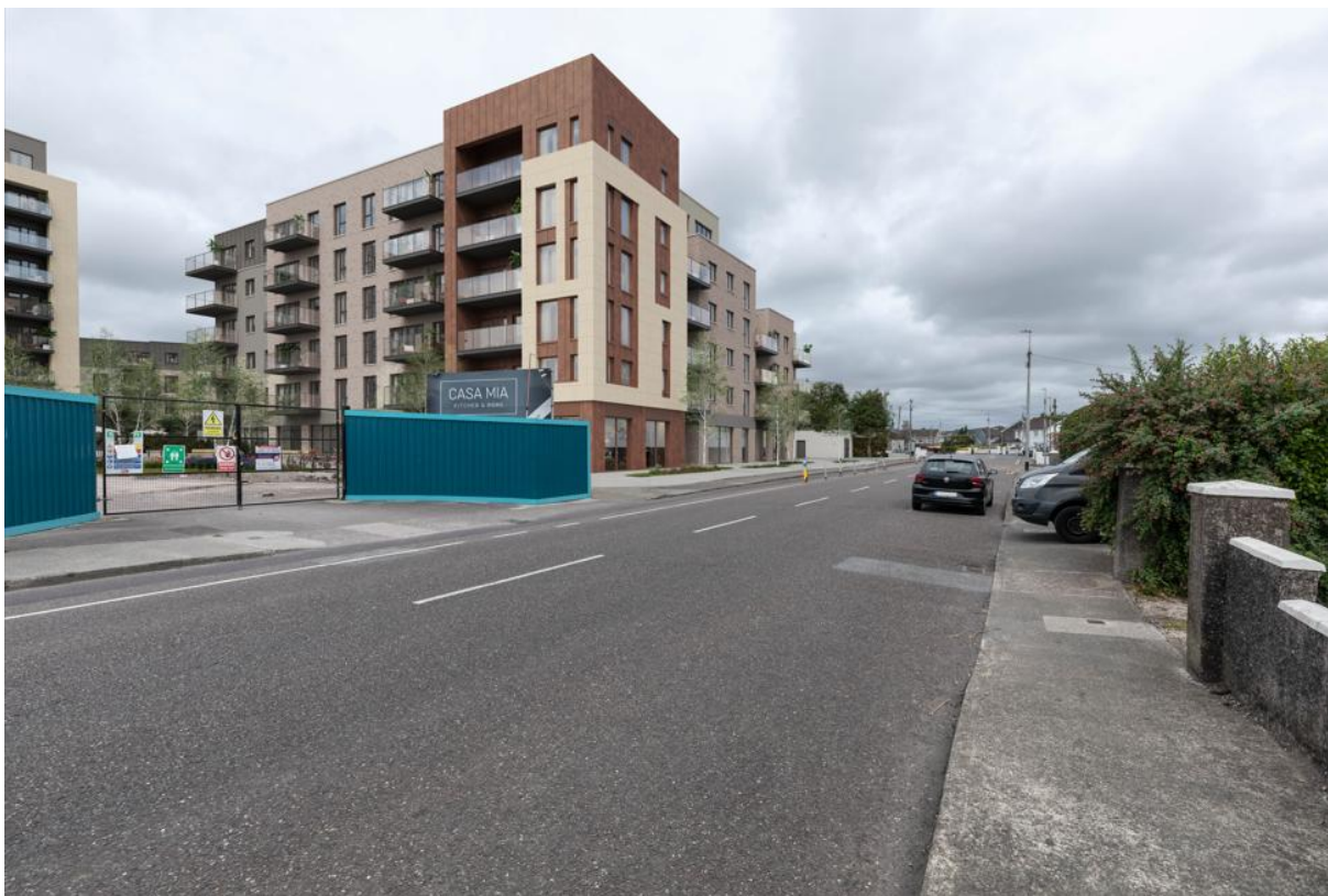
Plate 5: View from Kinsale Road to the site to the north-west (with scheme)