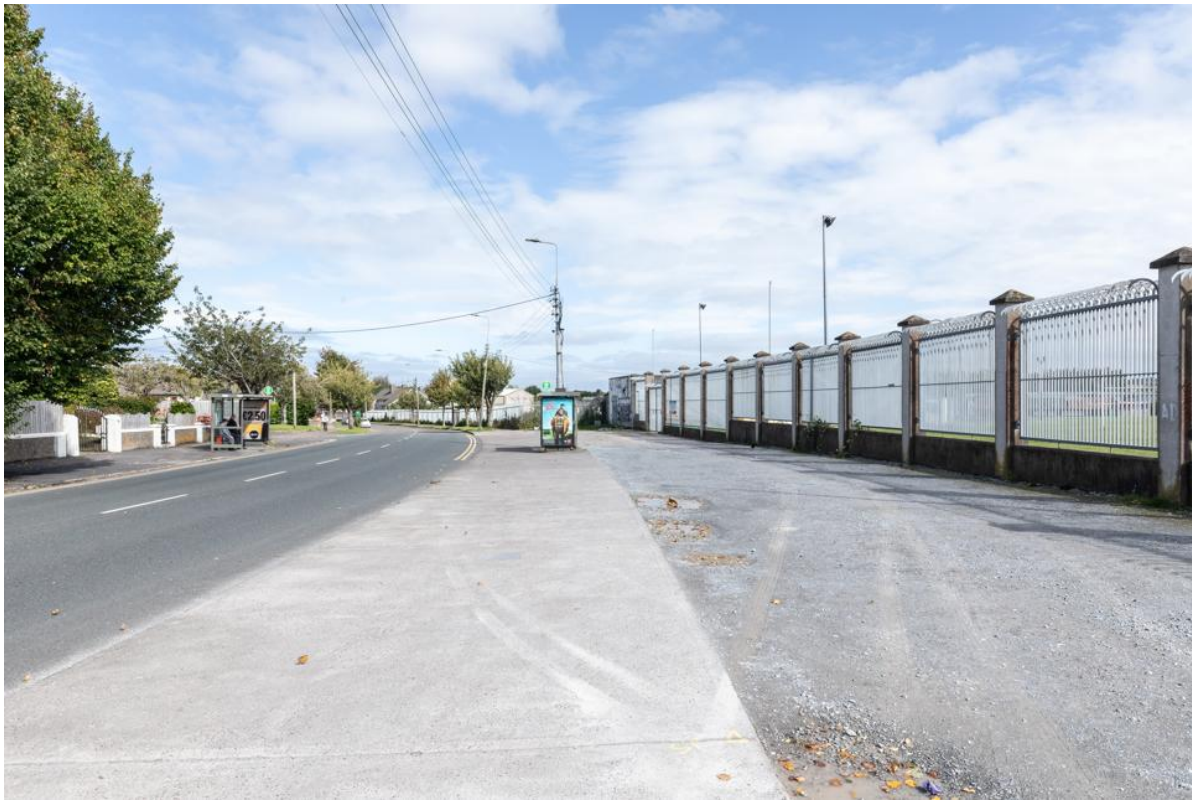
Plate 6: View from Pearse Road to the site to the north-east