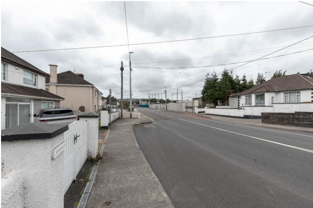
Plate 2: View from Kinsale Road to the site to the south-west