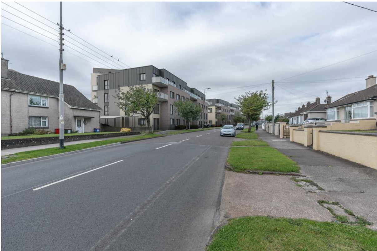
Plate 9: View from Pearse Road to the south-west (with scheme)