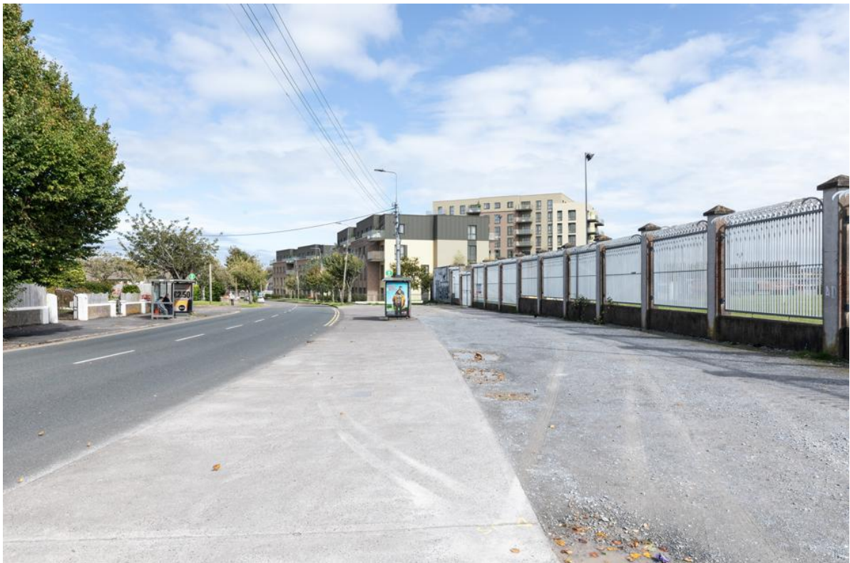
Plate 7: View from Pearse Road to the site to the north-east (with scheme)