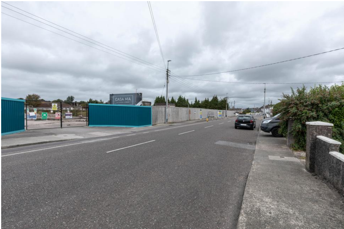
Plate 4: View from Kinsale Road to the site to the north-west