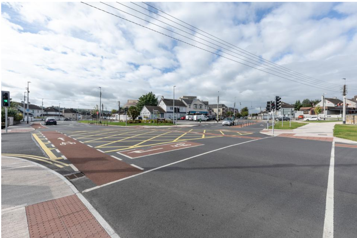
Plate 11: View from Kinsale Road towards Pearse Road to the south-east (with scheme)